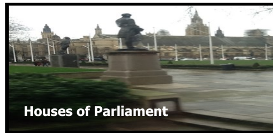
Houses of Parliament