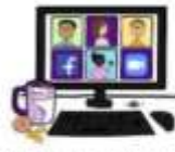
Digital and 1:1 support